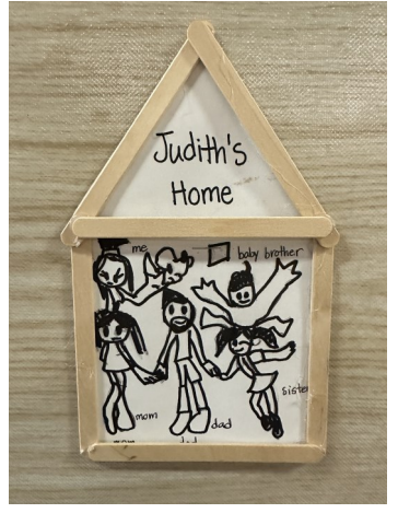
Who lives in my home?