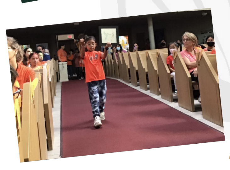
Indigenous art being carried forward to the prayer table.