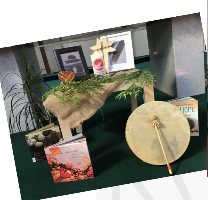
Grade 4 lead our prayer service for Truth & Reconciliation.

Together we move towards Reconciliation. A number of different symbols were brought forward (books, hummingbird, a paddle, shoes, water, and cedar boughs) to show our school's commitment to action through academics, art, sports, advocacy, and faith. These symbols are our school's commitment to engage in the process of truth & reconciliation.