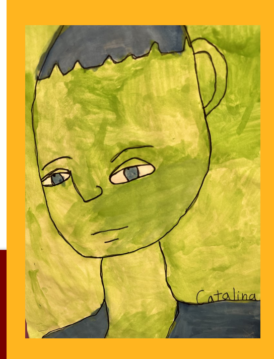
Gr 2M Cubanism artwork inspired by Pablo Picasso