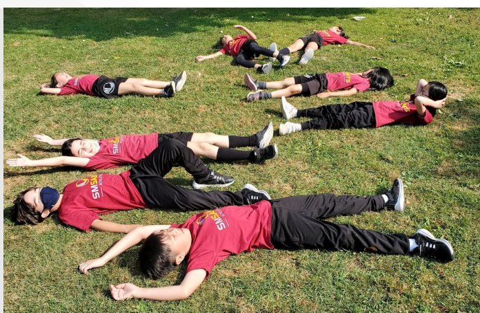
Grade 3P enjoying a rest after their first day of distance running.